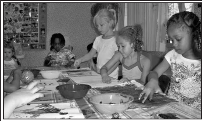
Fingerpainting and summer fun

Hooray! At Swissvale we are so excited to enter into our 20th year of service to the community; not to mention celebrating our 25th birthday as an organization! We have had the rare opportunity to visit and connect with many of our children who have now started their careers or moved on to higher education. It never ceases to amaze me when former clients touch base with us again and share the positive impact that the organization has had on their lives. We would like to welcome our new clients who are students at Pitt, Carlow, Empire Beauty School, Stanford Brown, Carnegie Mellon and Triangle Tech, along with their six daughters and one son.