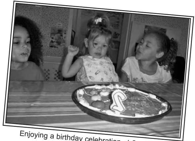
Enjoying a birthday celebration at Swissvale

The summer flew by as it always does. Although we had a great deal of rain it provided many opportunities for different kinds of outdoor play and opportunities for experimenting and exploration. Our new rain barrel filled quickly providing an inexpensive and sustainable water source. A week in August provided us a chance to give our site a complete overhaul. Our wonderful teachers wholeheartedly participated in deep cleaning, organizing and doing minor repairs and renovations. What a difference this time and effort makes in maintaining the high quality services we offer. We are also in the process of getting our new roof which will enhance our commitment to sustainability.