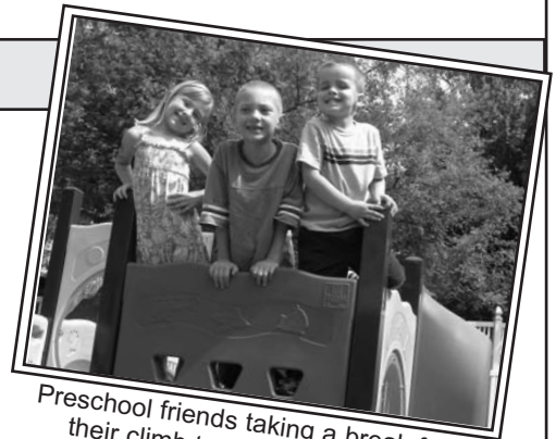
Preschool friends taking a break from their climb to give a quick smile

Thank you to everyone who supports our organization throughout the year. You help us to provide the children with the care and opportunities they need to grow. Have a wonderful autumn!