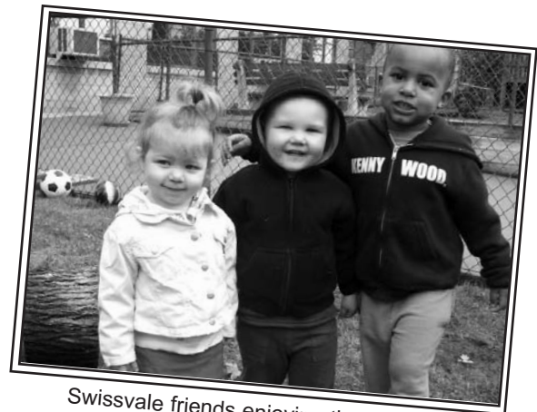
Swissvale friends enjoying the cool air.

We would like to thank everyone for their continued support of our organization. During the holidays we see so much generosity and kindness it warms the heart especially during the recession. At Angels' Place we are fortunate to have the support of good friends who also remember us throughout the year. Our organization is blessed to have so many who care so much. We wish you all a very Merry Holiday season full of good wishes and good health.