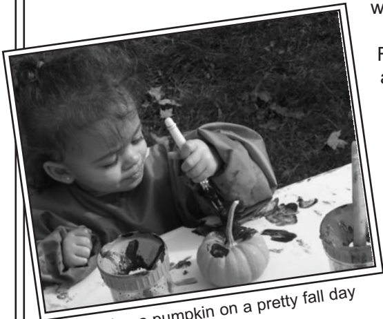
Painting a pumpkin on a pretty fall day