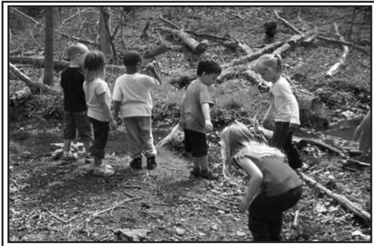
Swissvale children enjoy the warm spring weather while on a nature hike.

On the subject of greening I would be remiss not to mention our success in recycling through the Paper Retriever program. In four short months, with all of your help and support, we have recycled 2.31 tons of paper. We have saved 6.93 yards of land fill space and 9,475.62 KWH of energy, and we are awaiting another pick up.