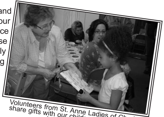
Volunteers from St. Anne Ladies of Charity share gifts with our children who are going into kindergarten.

Both those who have supported Angels' Place through the years and our new friends play a significant role in the successes of our graduates. Without the generosity of our donors, Angels' Place would not be able to provide the many services that help these parents attain goals. From everyone at Angels' Place – especially from our graduates – we send a heartfelt thanks to all our caring friends for investing in the futures of these young families!