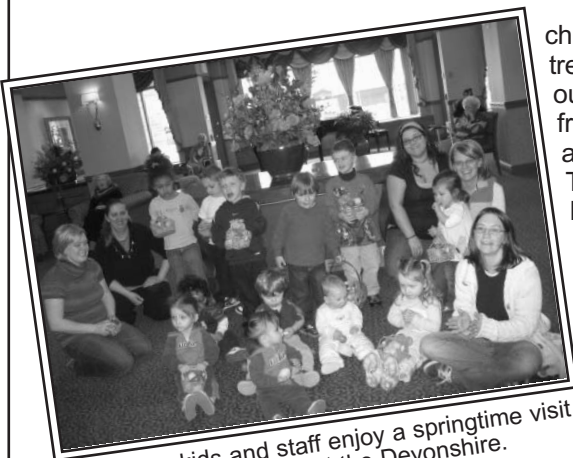
Brookline kids and staff enjoy a springtime visit with our friends at the Devonshire.