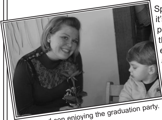
Mom and son enjoying the graduation party.

Spring is one of the happiest times of the year at Angels' Place because it's a time when we honor the accomplishments of our graduating parents! We also celebrate as several of the children in our care make the exciting transition into kindergarten. Our three centers enthusiastically host graduation parties and share in the thrill of goals achieved.